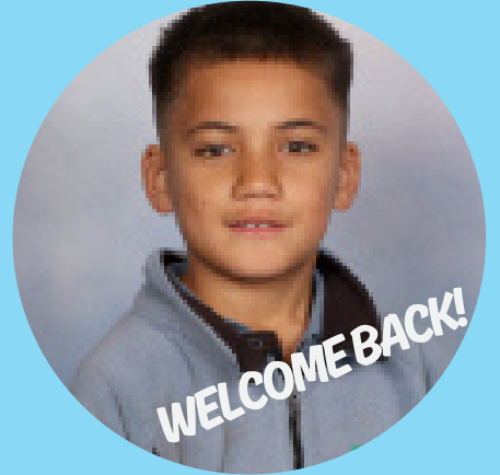
Wairua - Space 6