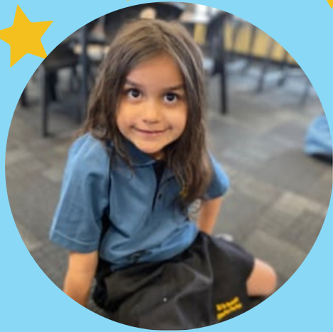
Lazuli - Space 4